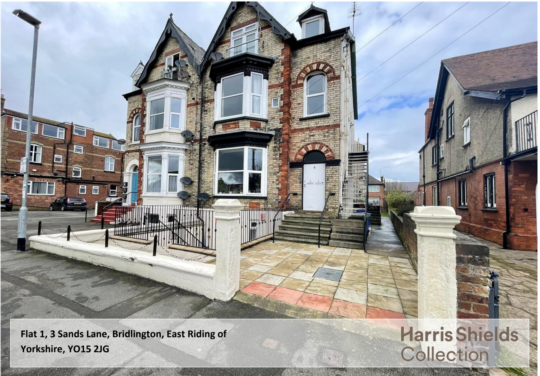
Flat 1, 3 Sands Lane, Bridlington, East Riding of Yorkshire, YO15 2JG